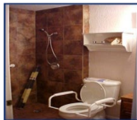
Bathroom after HISA

A $6,800 lifetime benefit may be provided to Veterans and Servicemembers for a service-connected condition or a non-service connected condition when rated 50% or more for a service-connected disability.